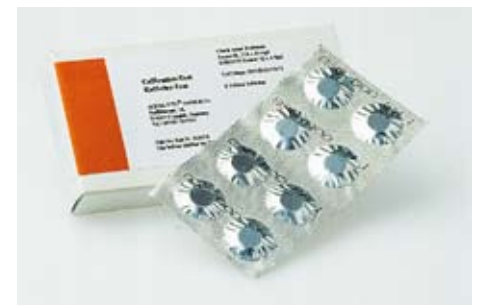
BOD CM test tablets, order code: 41 83 28

The tablets are easy to use. Simply place a tablet in the BOD bottle, start the measurement process, read off the BOD value after 5 days, and then compare with the defined value. If this value is within the quoted tolerance, this means that the BOD measuring system is functioning correctly.