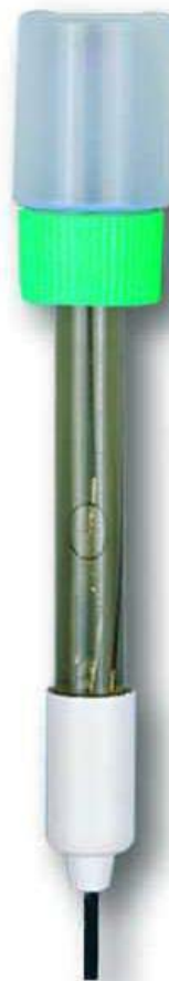
pH electroode ( optional )