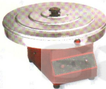
Model- JSEL 24