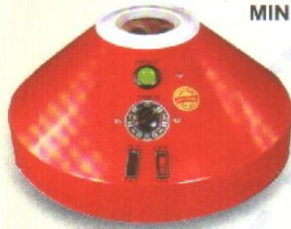
Model- JSEL 11