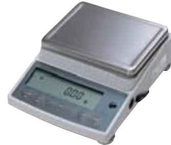
BL620S BL3200S BL2200H BL3200H